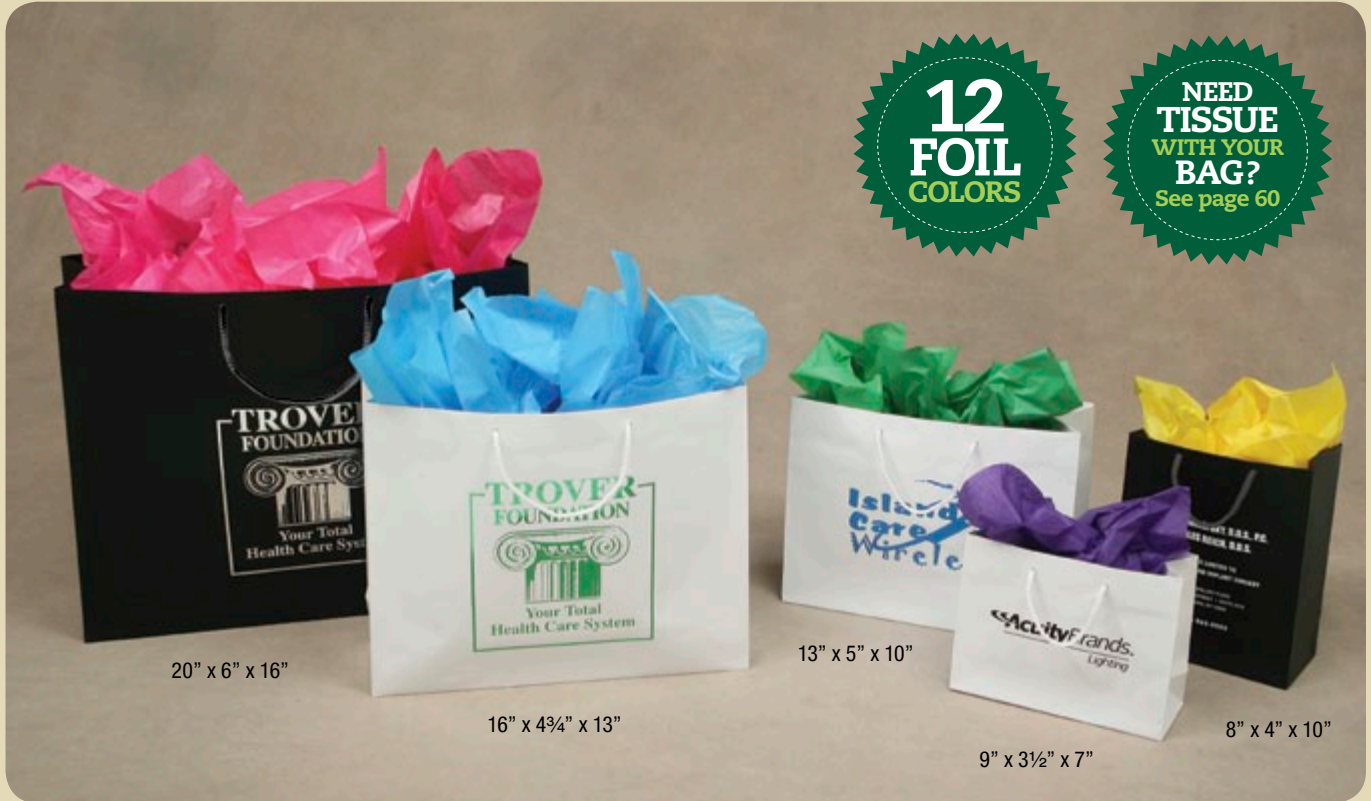
20" x 6" x 16"

Foil stamping provides highly visible and tasteful advertising on these heavyweight European shoppers. Cosmetic dentists, plastic surgeons and event planners appreciate this professional looking bag.